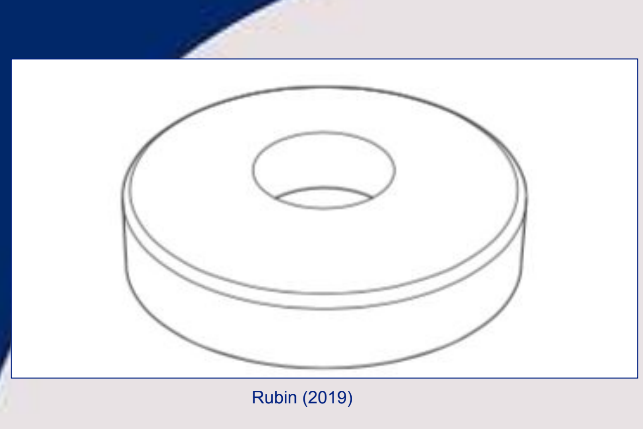
Figure 2. Collision dyspareunia aids may be particularly helpful for those with deep dyspareunia. These aids are tire-shaped buffers that, when placed at the base of a or dildo, decrease penetration depth.4