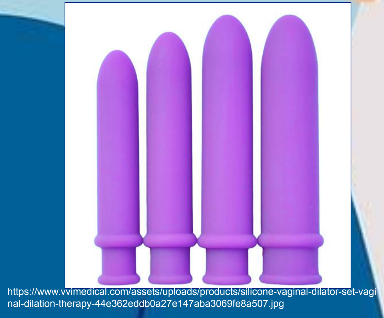
Figure 4. Gradual stretching of the vagina through dilator therapy is another method used to treat dyspareunia. It prepares the person physically and psychologically for penetration.9 Vaginal narrowing may occur from involuntary contraction or from scarring. <sup>9</sup>