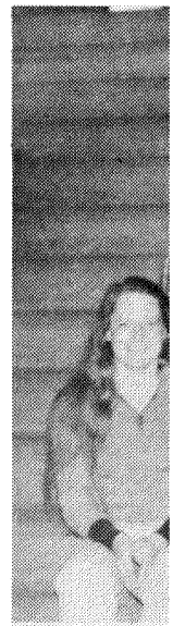
The Cast of President Famed Beaver