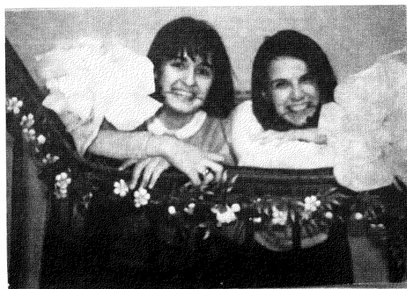
It's so Spanish — that's why we like it!

In evaluating the four-month stay in Colombia, American students generally have found it well organized and have praised its responsibility to the interests and needs of the individual student.