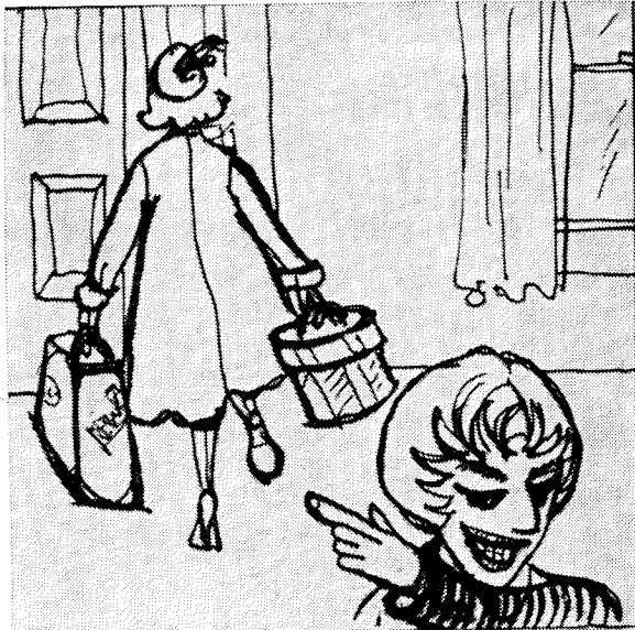
Her English Prof caught her reading "True Romances."

Most credit, however, must go to the kindly and brilliant gentleman who made "The Confidential Clerk" at all possible, T. S. Eliot.