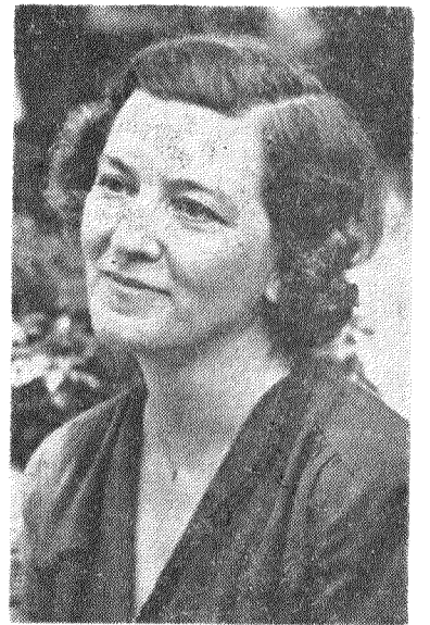
Honors Day Speaker