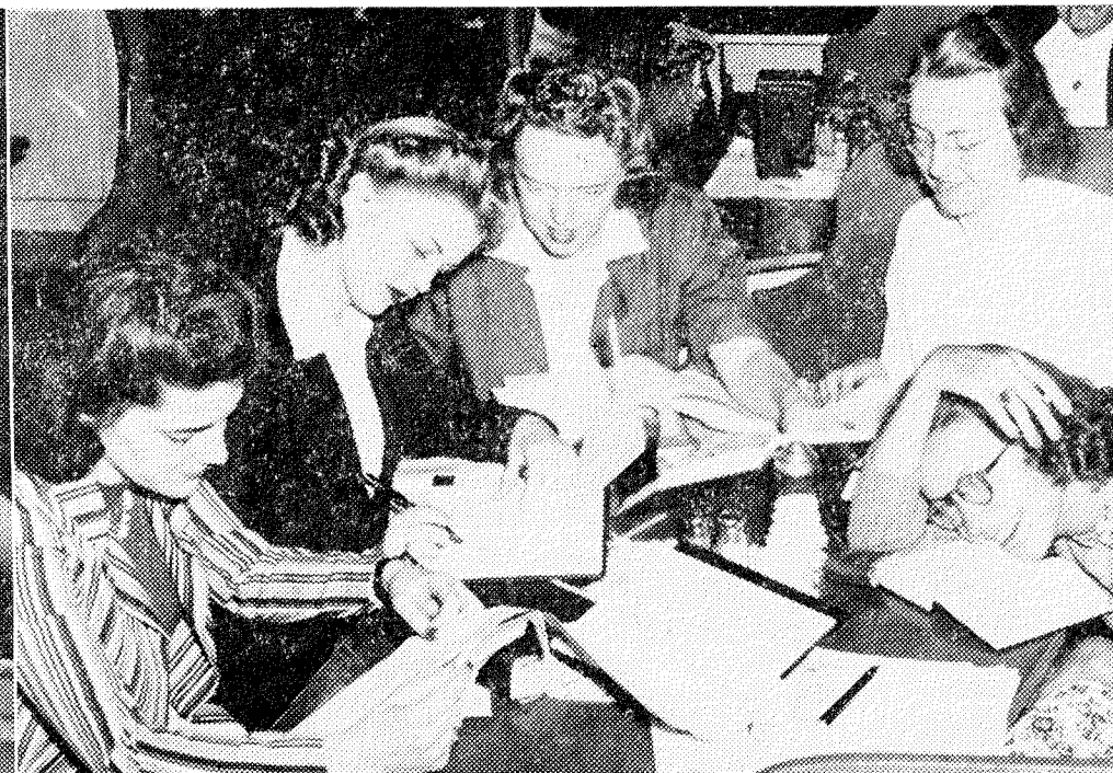
Cramming in the Chatterbox