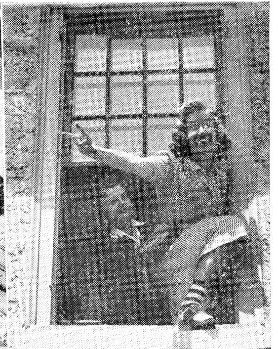
Don't Jump YET!