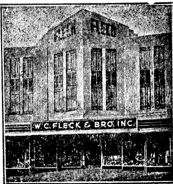
309 York Road, Jenkintown Phone Ogontz 72