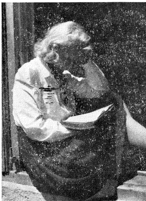
Musing over Milton