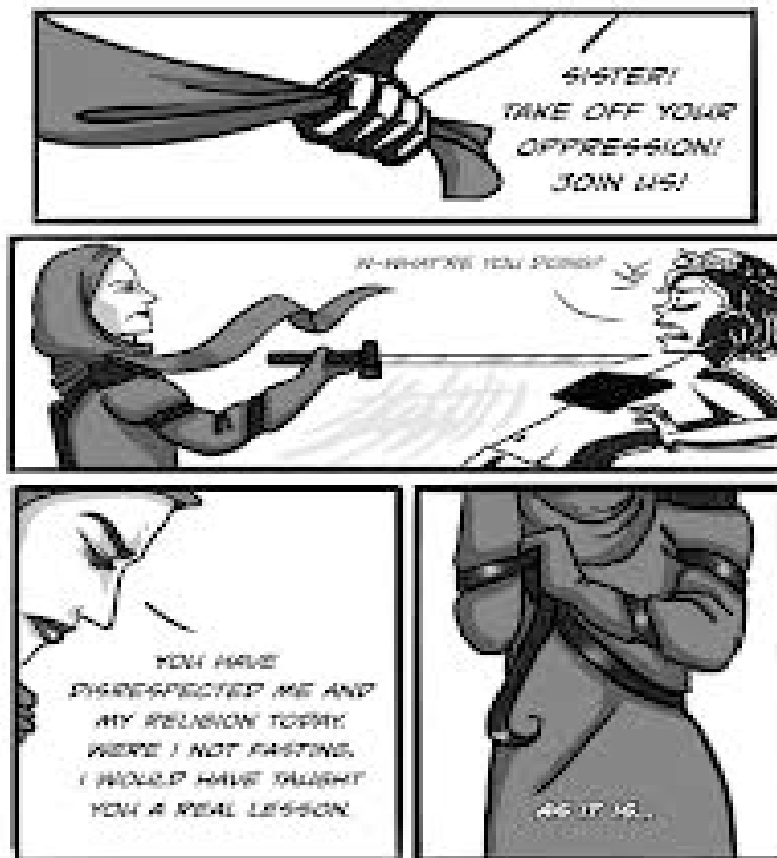
FIG. 6. This scene shows the hybrid identity of Satrapi taking place. (Satrapi, Marjane. The Complete Persepolis. New York: Pantheon Books, 2007. 6. Print.)